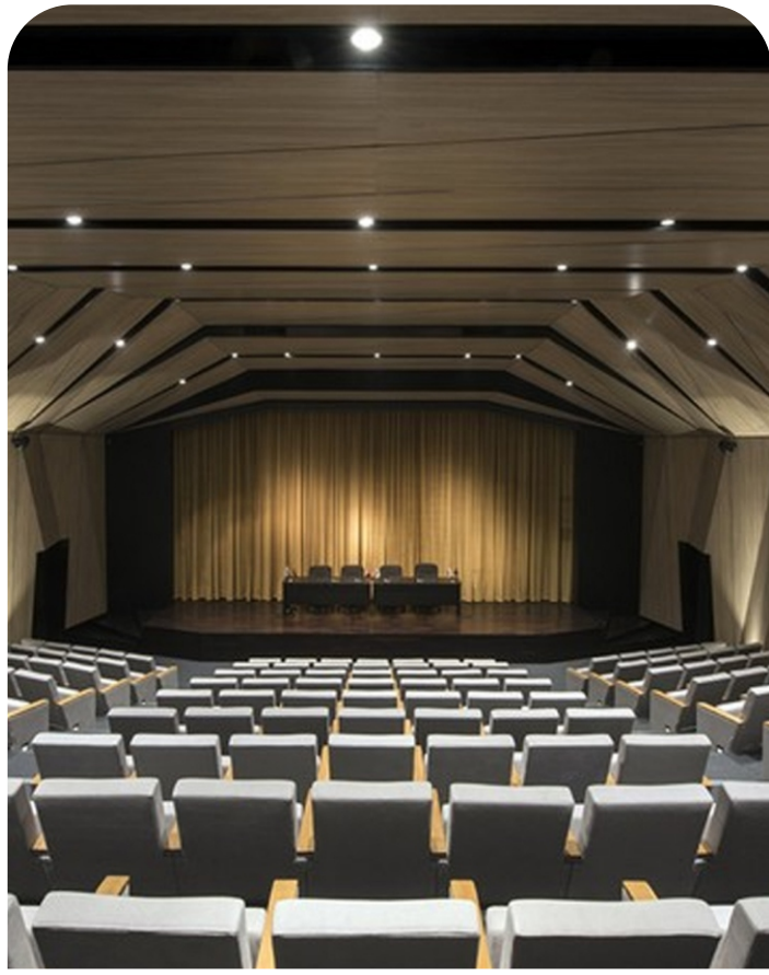
Conference Hall-1 (Capacity: 100 Pax)

The Conference Halls are ideal for organizing business and corporate events, including conferences, business meetings, workshops, get-togethers, birthday party, wedding etc.