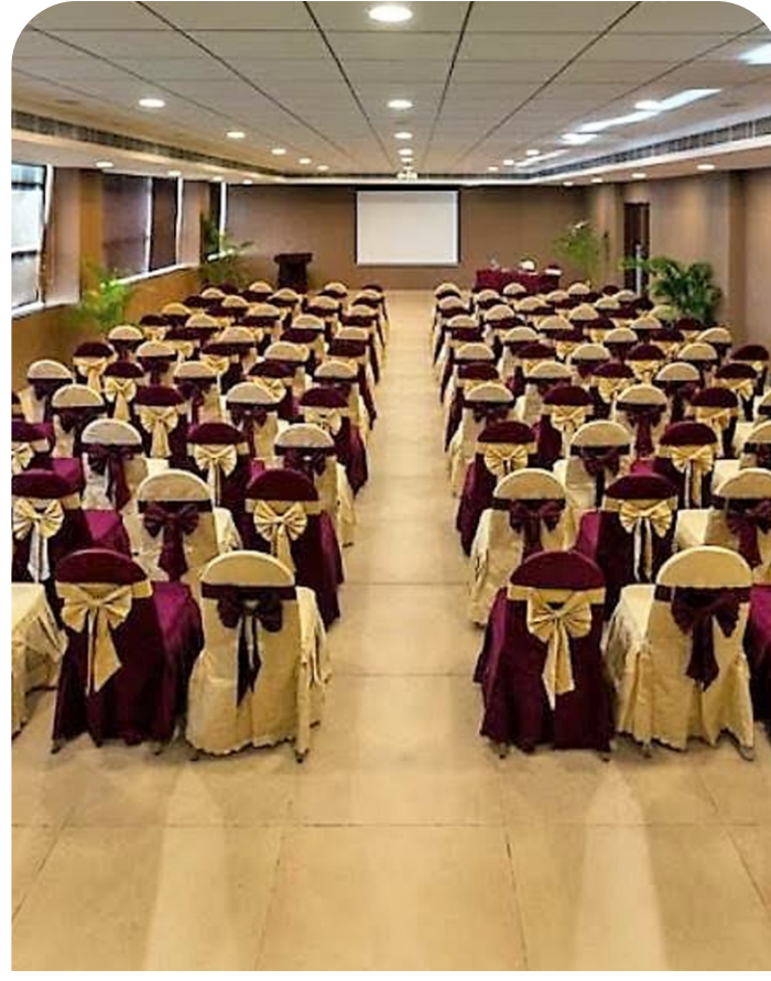
Conference Hall-2 (Capacity: 40 Pax)